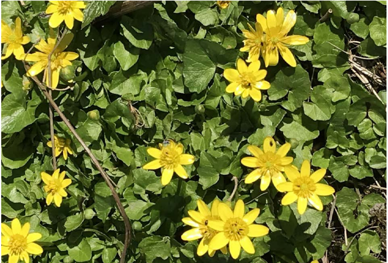
Beautiful bright yellow Celandine