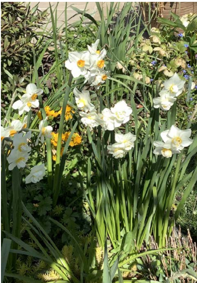
Final flourish of spring bulbs