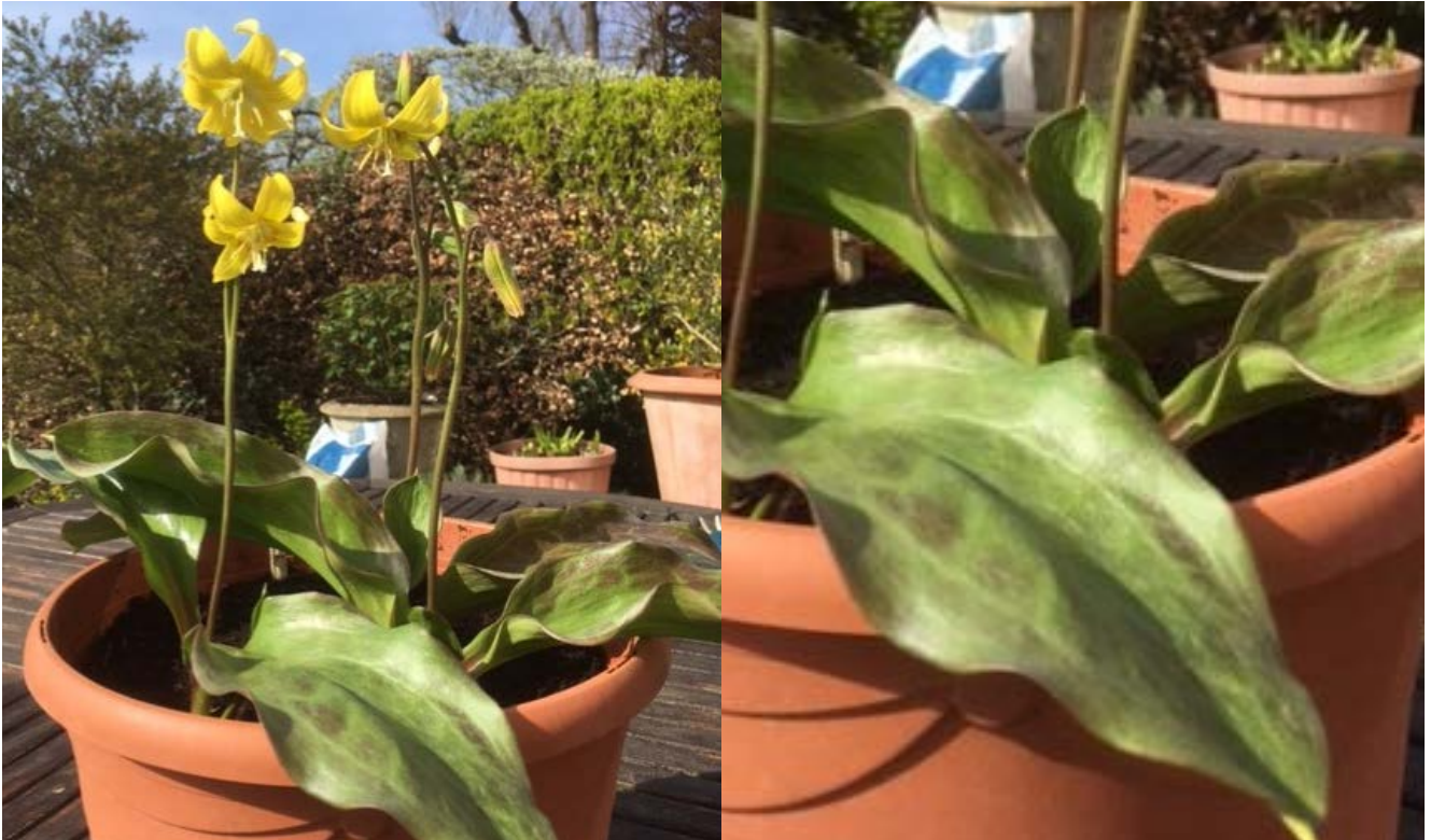
Every year I try to grow something I haven't grown before, so here it is, this years pride and joy. Sadly the picture doesn't really show the wonderful purple markings on the leaves, makes it look quite exotic!