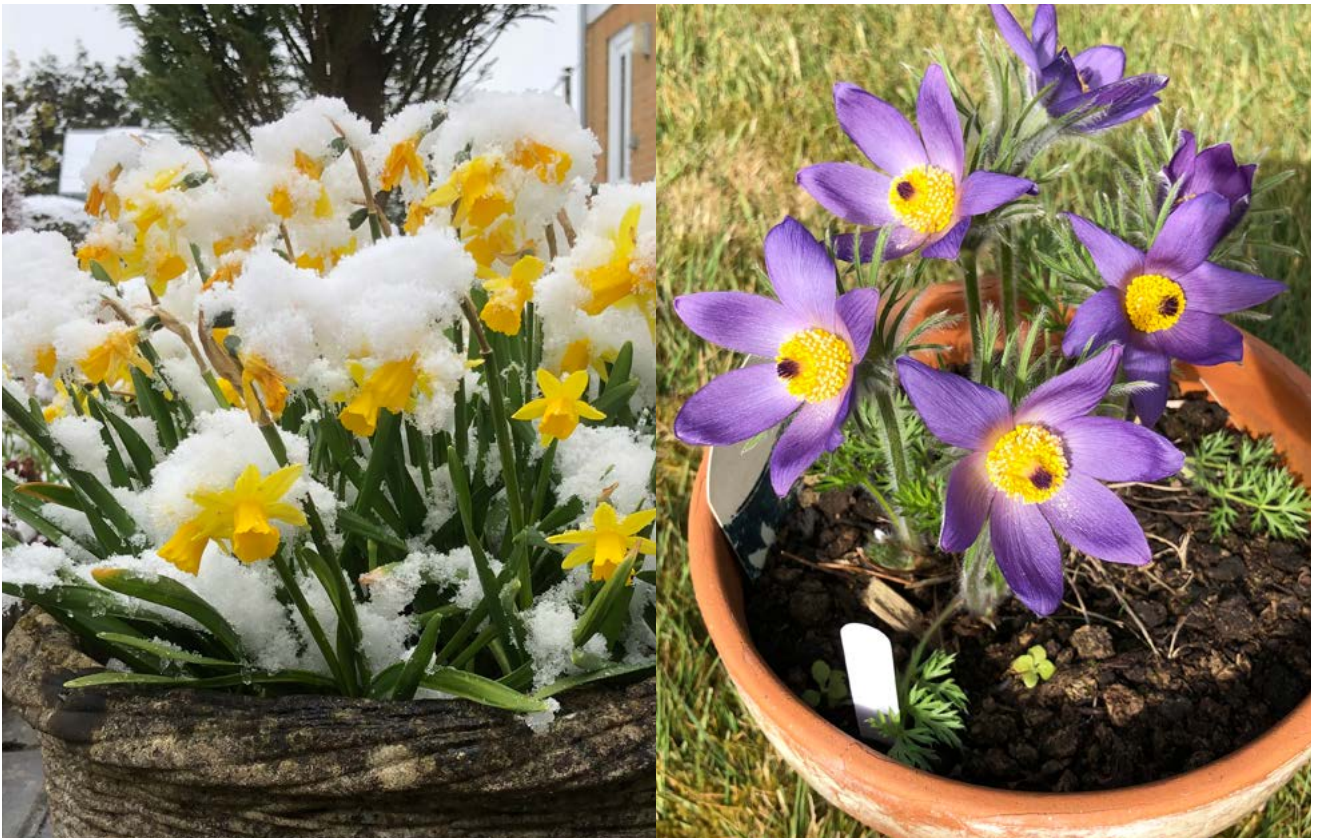
Two sides to April and all in the space of a couple of days