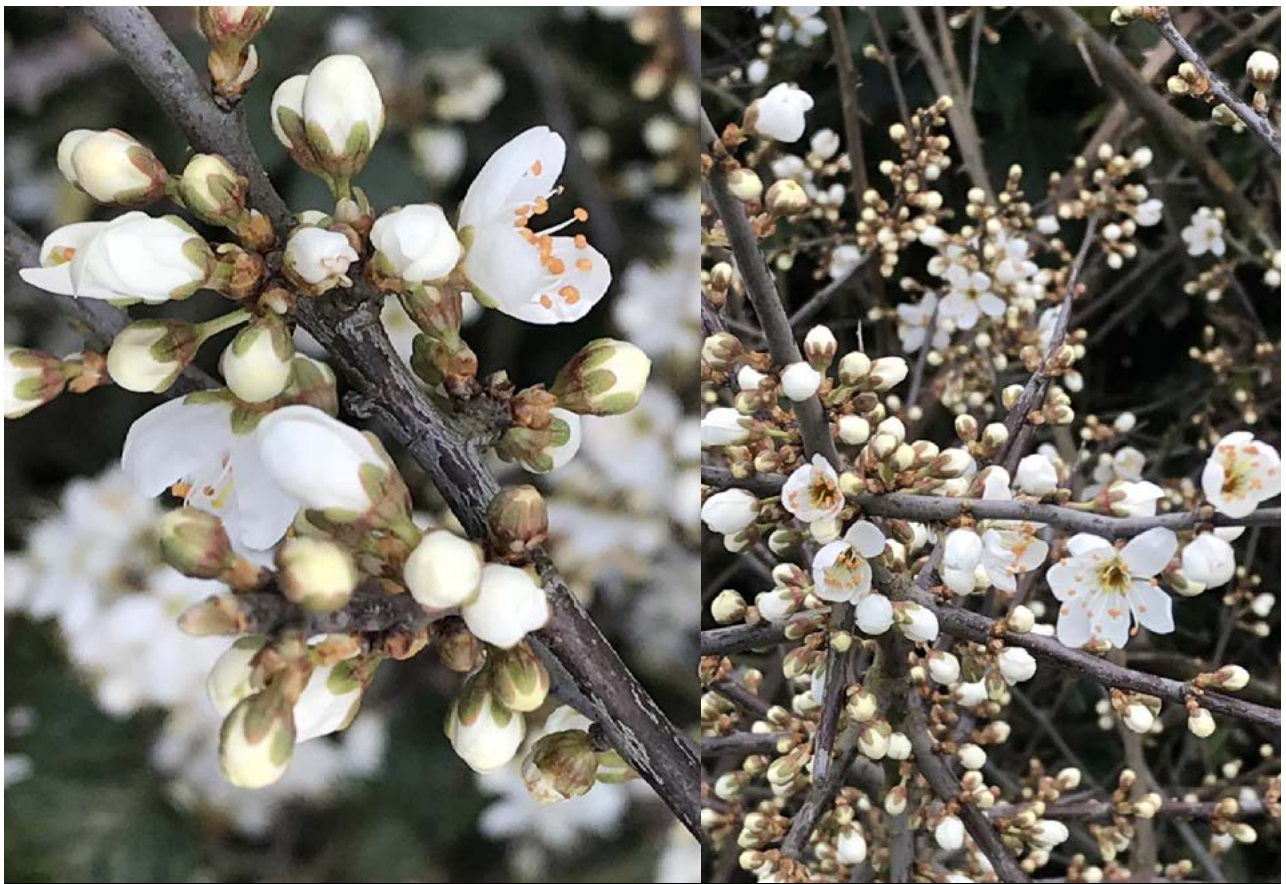
Blackthorn blossom near Lodge Hill