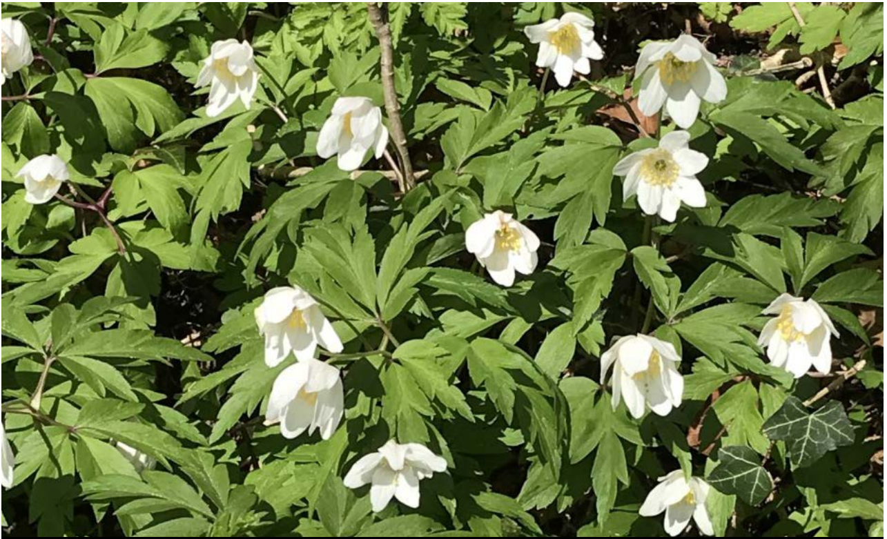
Wood Anemone near Lodge Hill