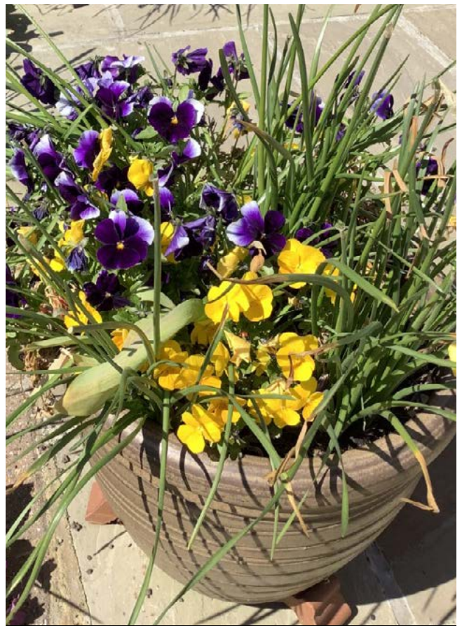
Underplanting in now taking over from the marvellous daffodils.