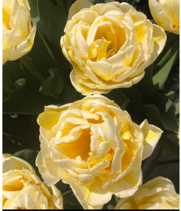
We ordered Flaming Margarita tulips, these aren't!!!!