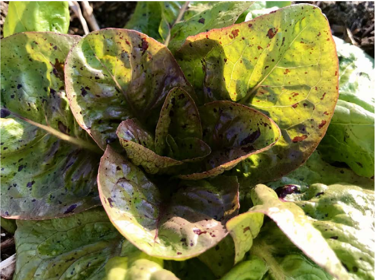
Amazing Austrian lettuce called 'Forellenschluss' translated means 'Speckled Trout'

Remember send in photos of your garden to horticultural.society@btconnect.com