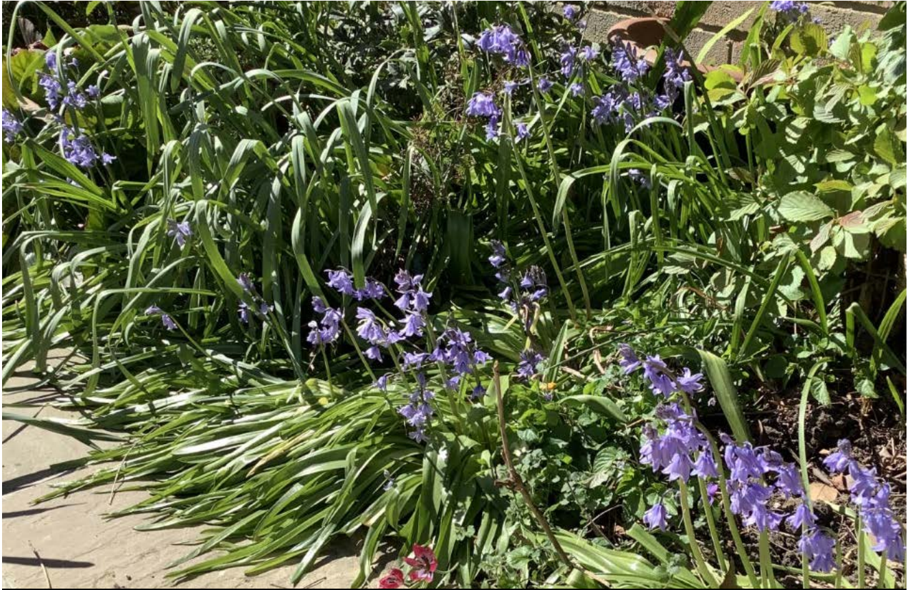
Bluebells are ringing in the end of our springtime flowers (I have never planted any but each year new clumps appear)